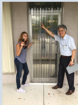
Prepping for Hurricane Michael