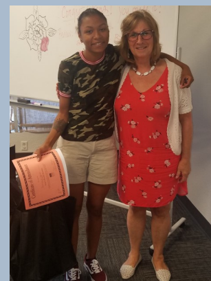
Members of the first Circle of Security graduating class. Seven participants successfully completed the group.