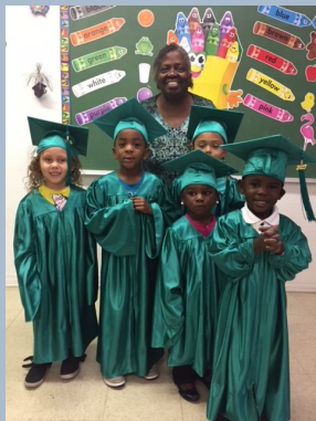
Oakwood Terrace graduates of the Incredible Years Program that completed December, 2017.